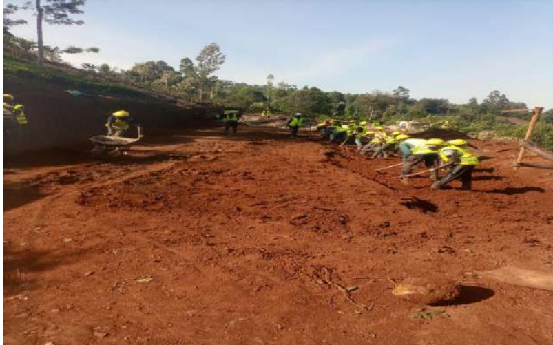
Settling basin excavation