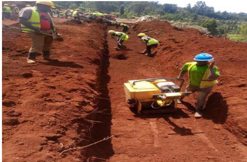
Settling basin excavation & backfilling