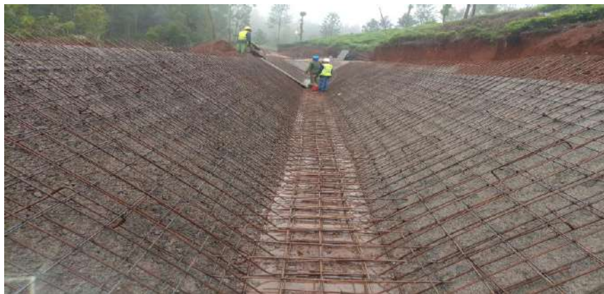
Settling basin steel works