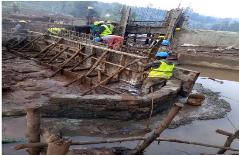
The floodwall construction in progress