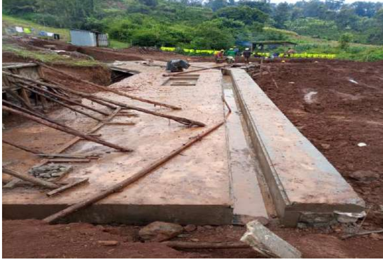
The hydrobox support slabs