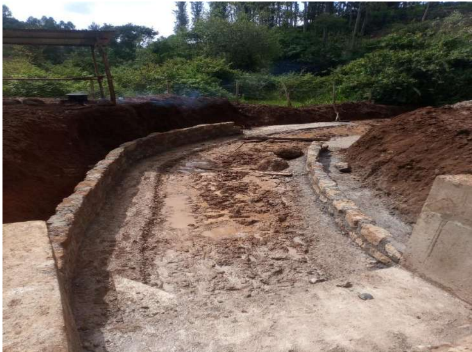
The tail race construction