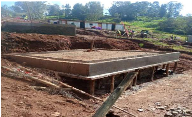
The transformer plinth